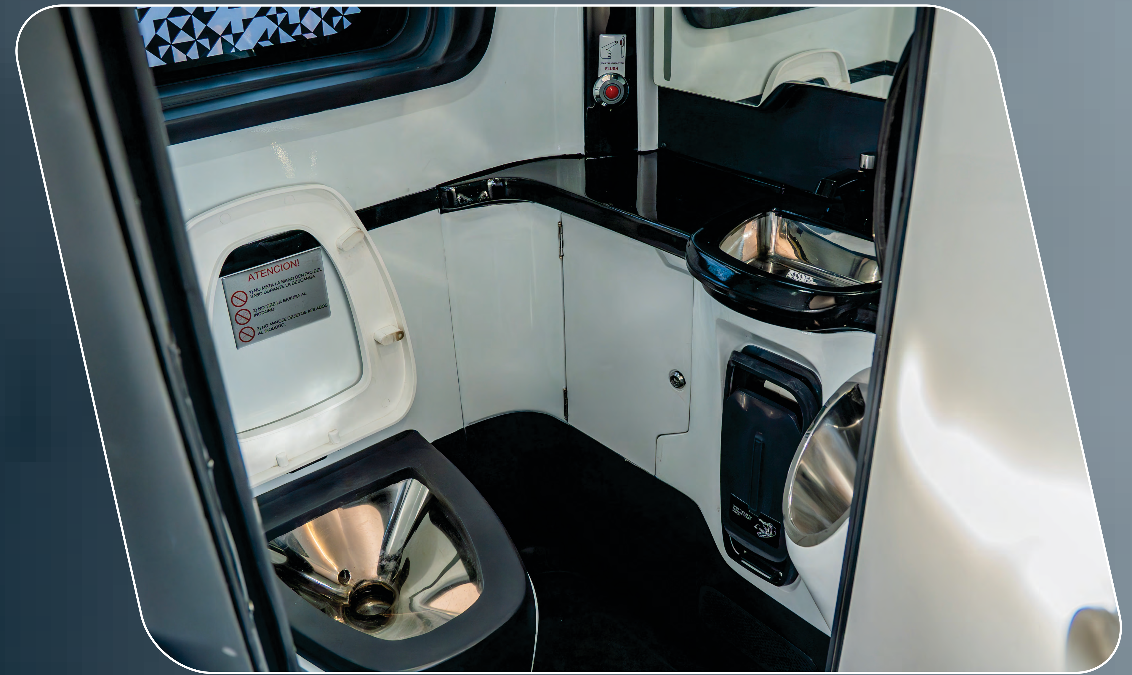
OPTIONAL: Restroom with a new system that reduces maintenance, supply and cleaning by 50%. Ecoflush system.