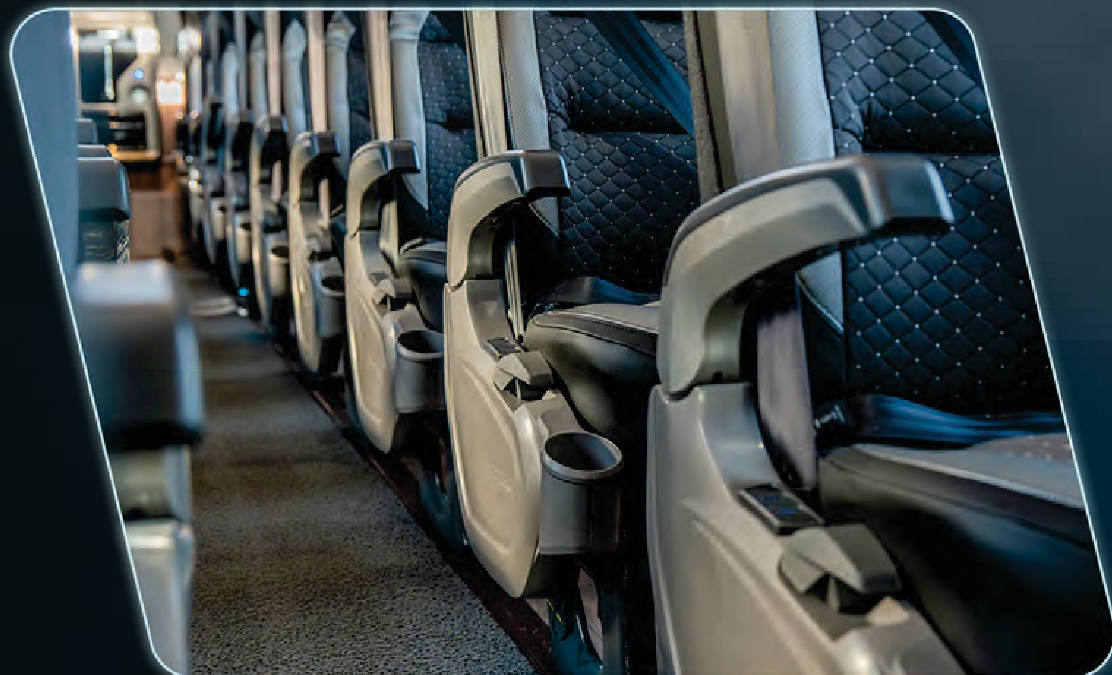
Seat equipped with cup holder, arm rests and footrests.