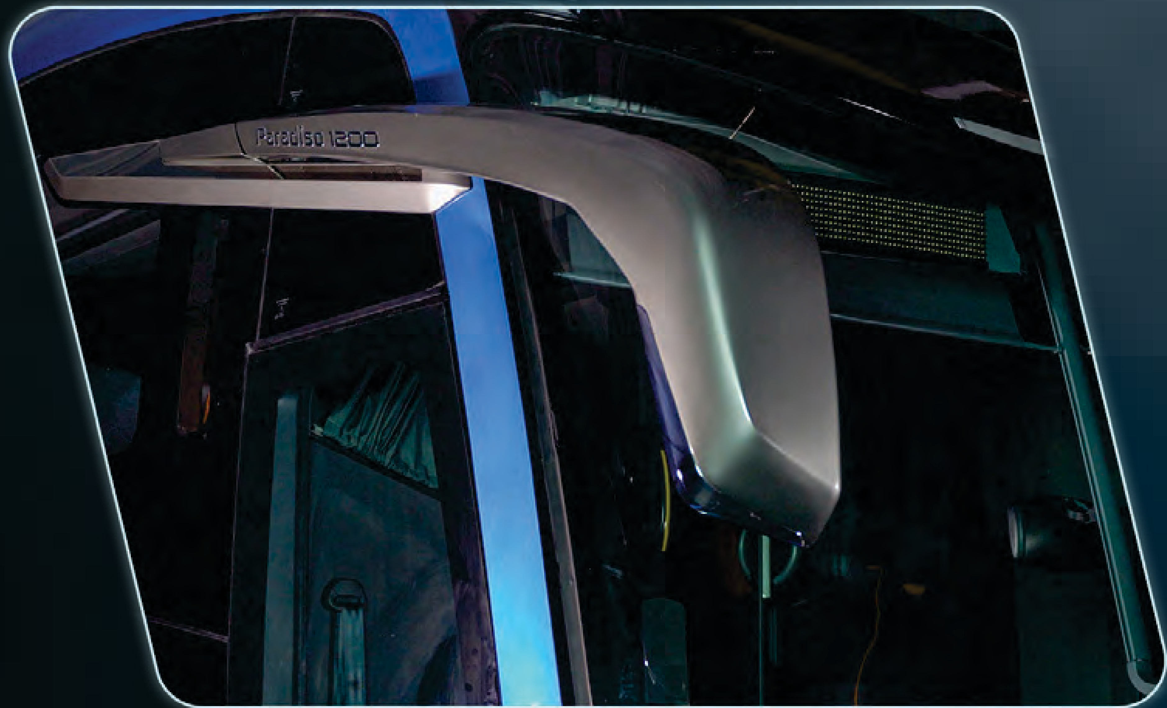
Increased rear-view mirror visibility.