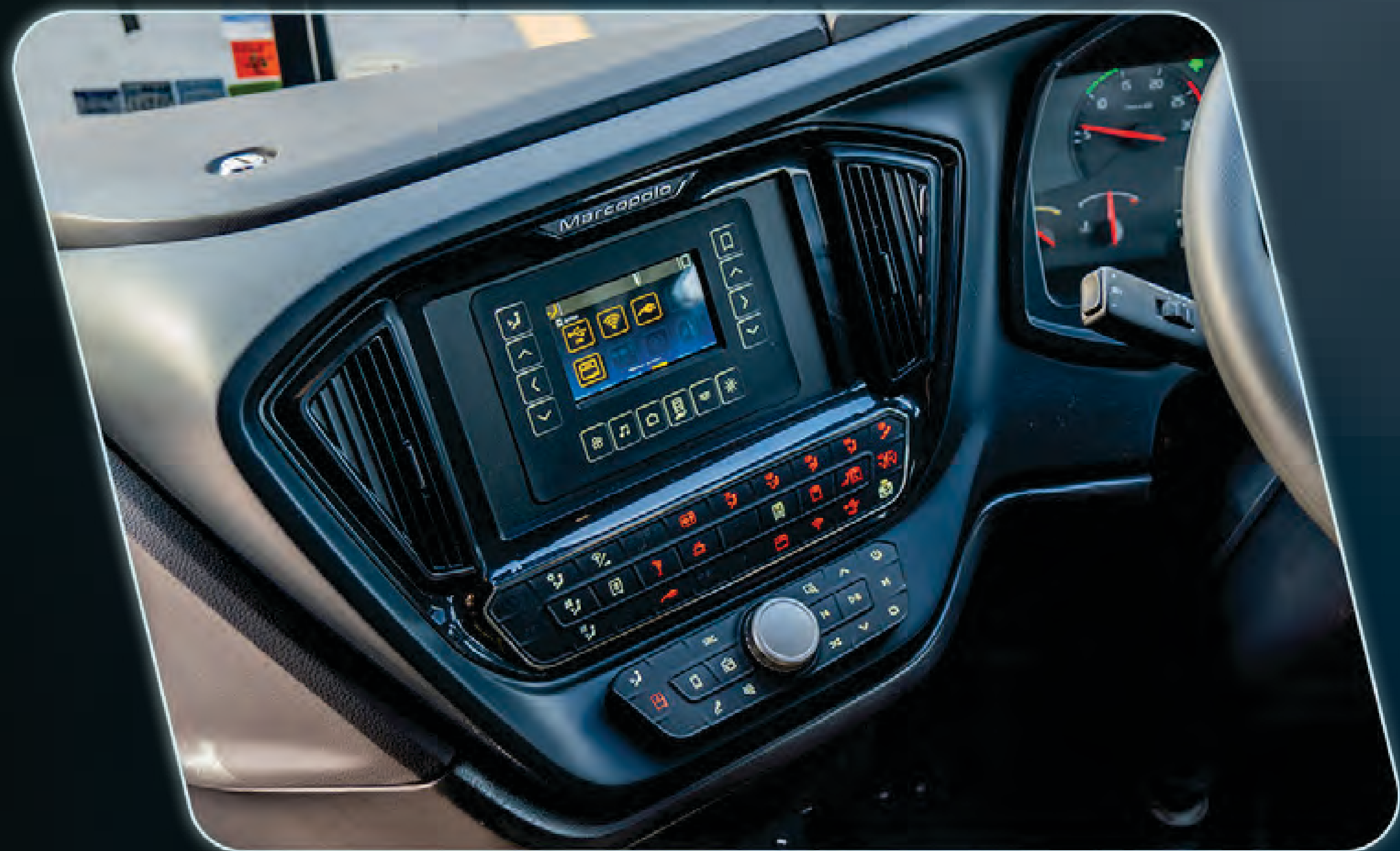
New Lohr touch screen multiplex.