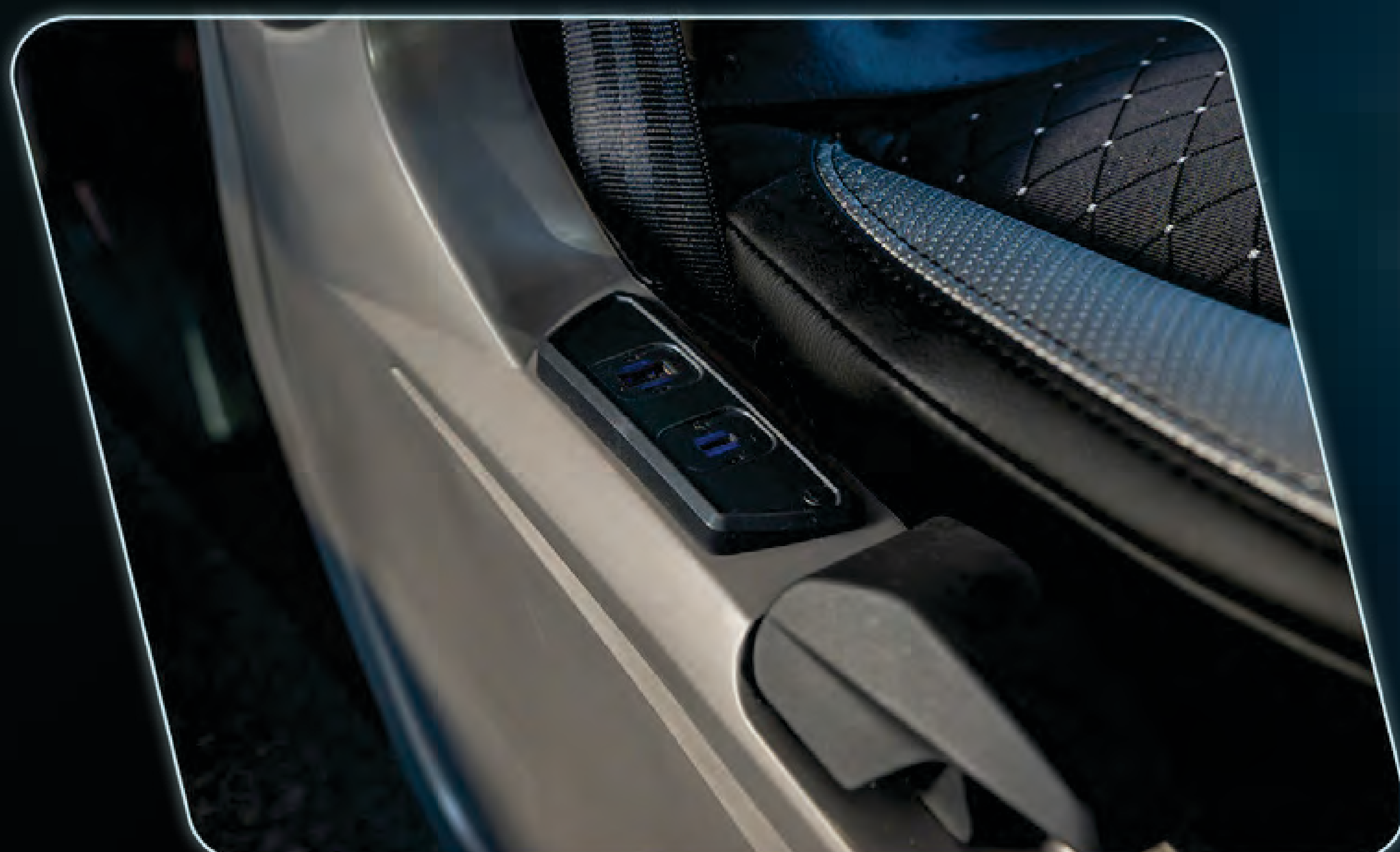
Old type and C type USB charging ports in seats.