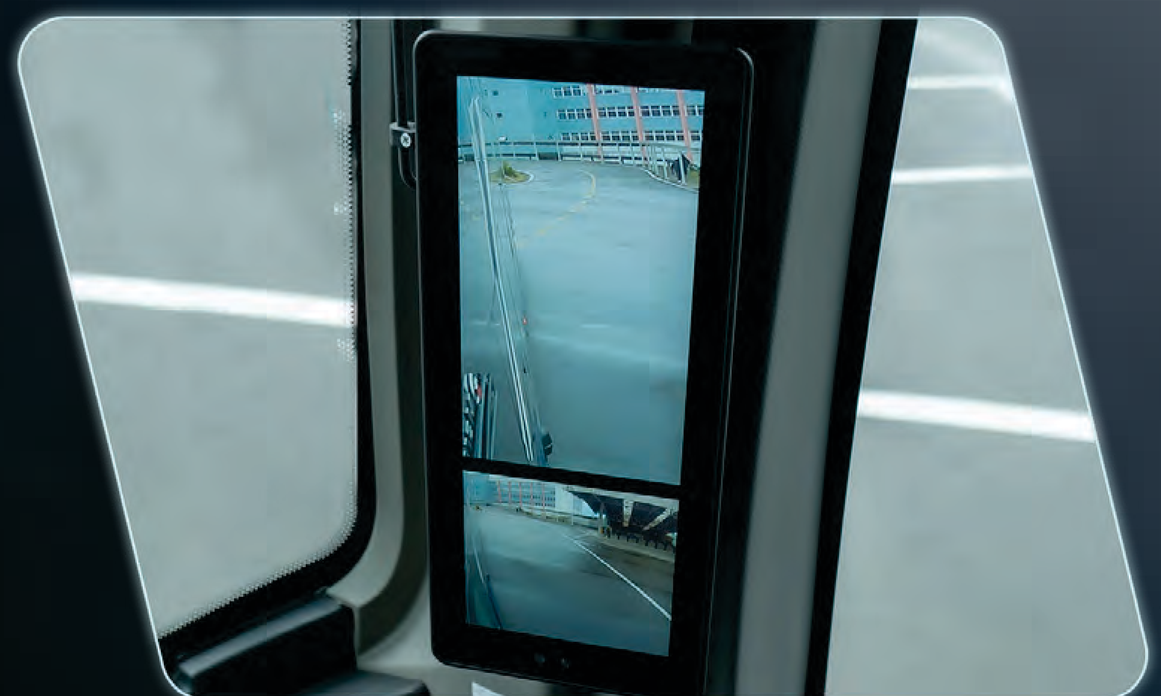
Camera rear view monitoring system (optional).