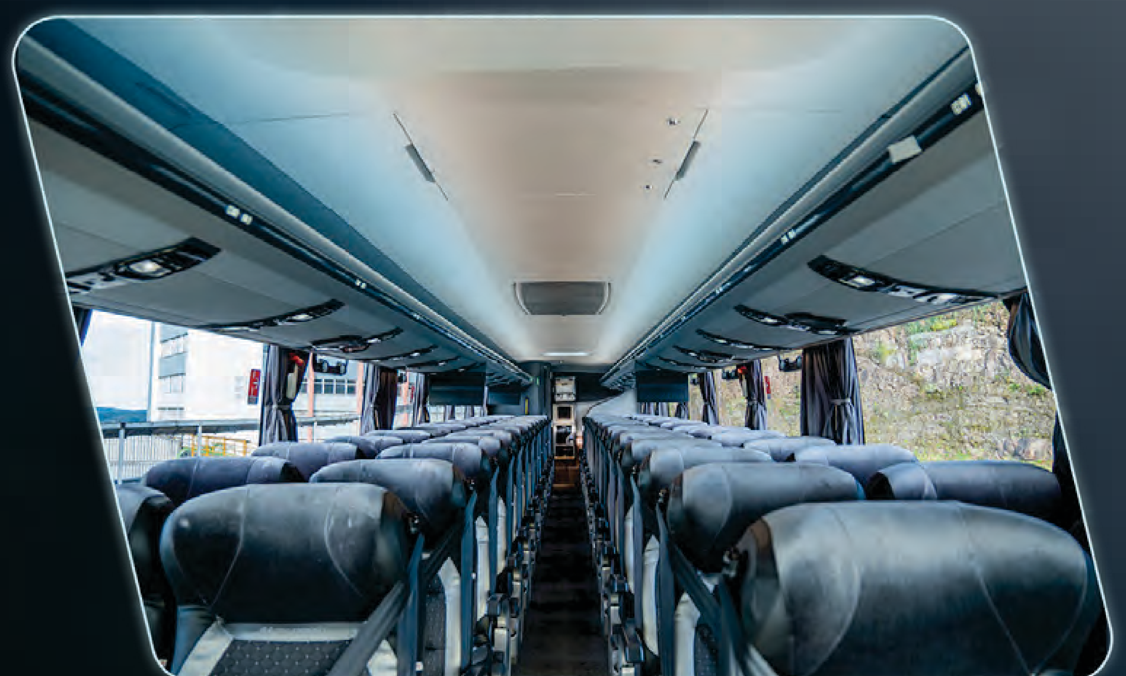
Cromotherapy lighting and saloon heaters, marine plywood flooring and interior curtains.