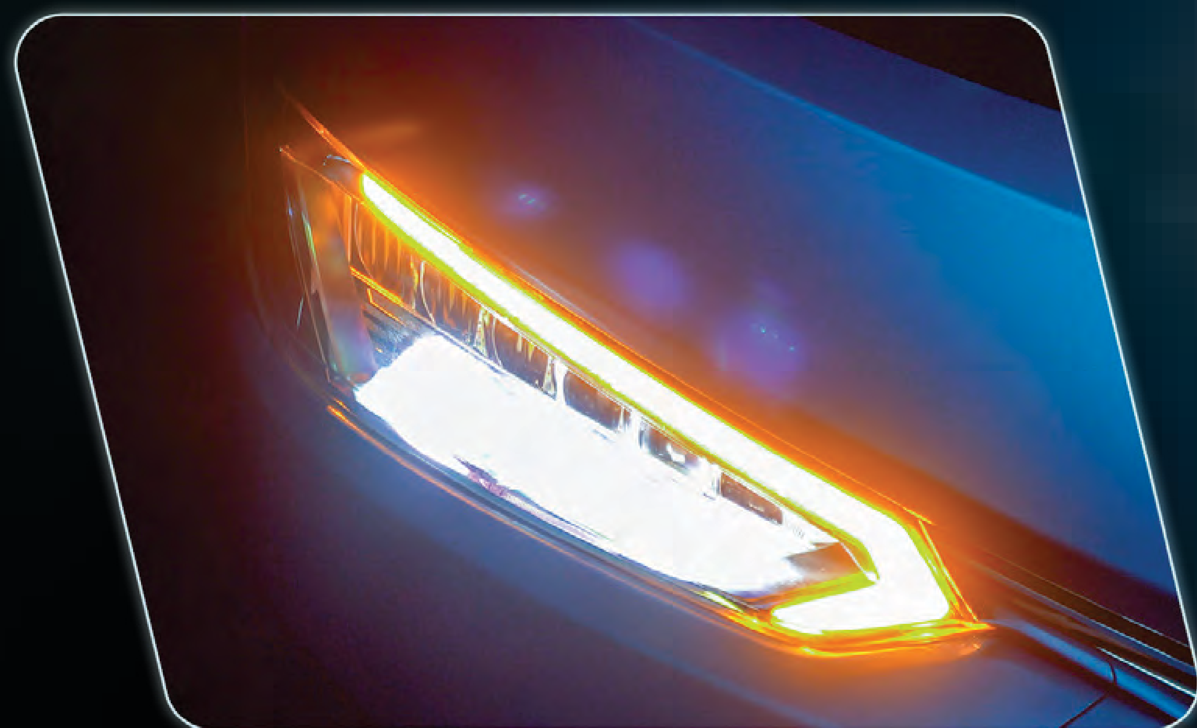
Full LED Improved light set with long-range lights and maneuvering light.