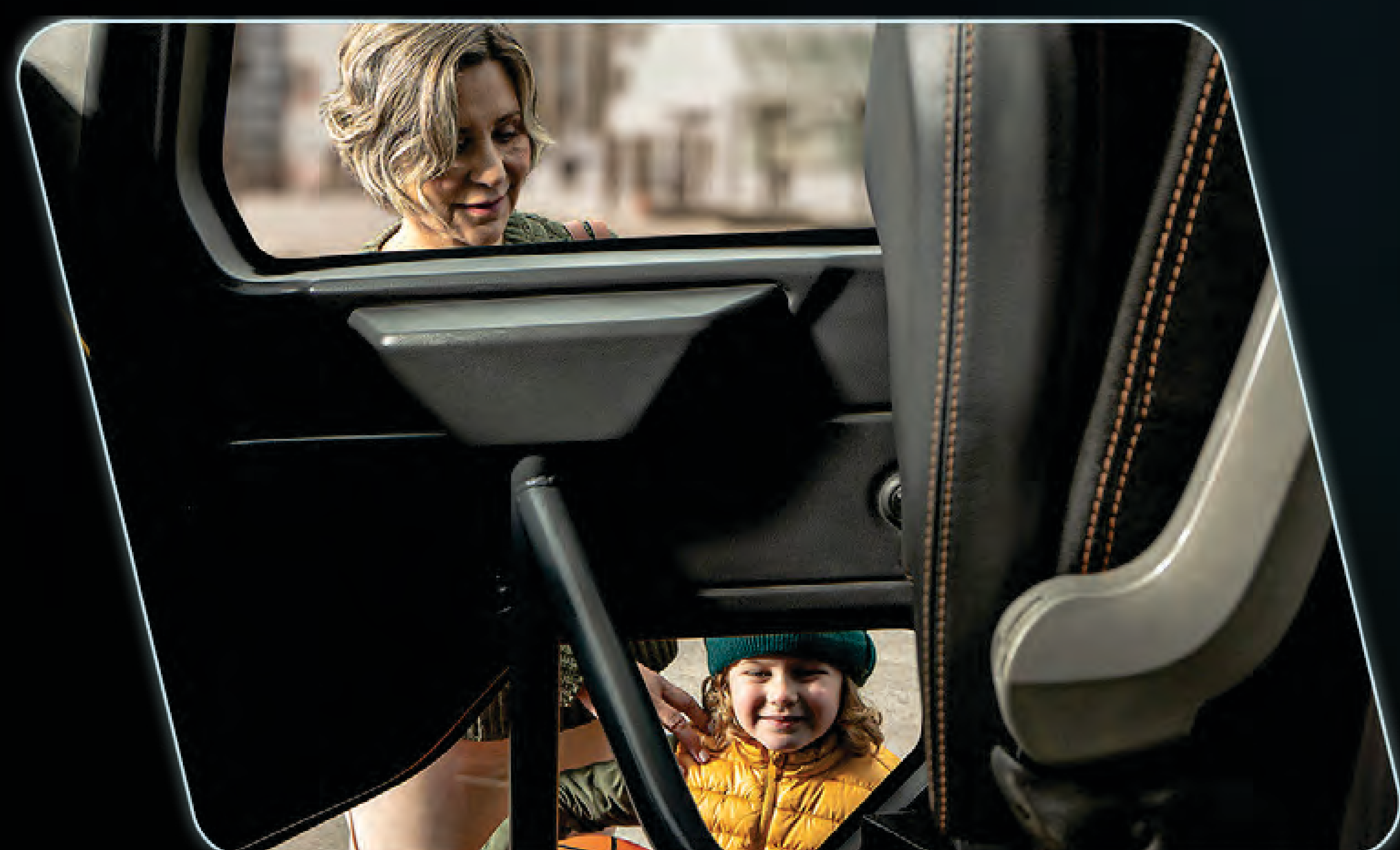
Translucent area on the door allows obstacles on the side of the vehicle to be seen.