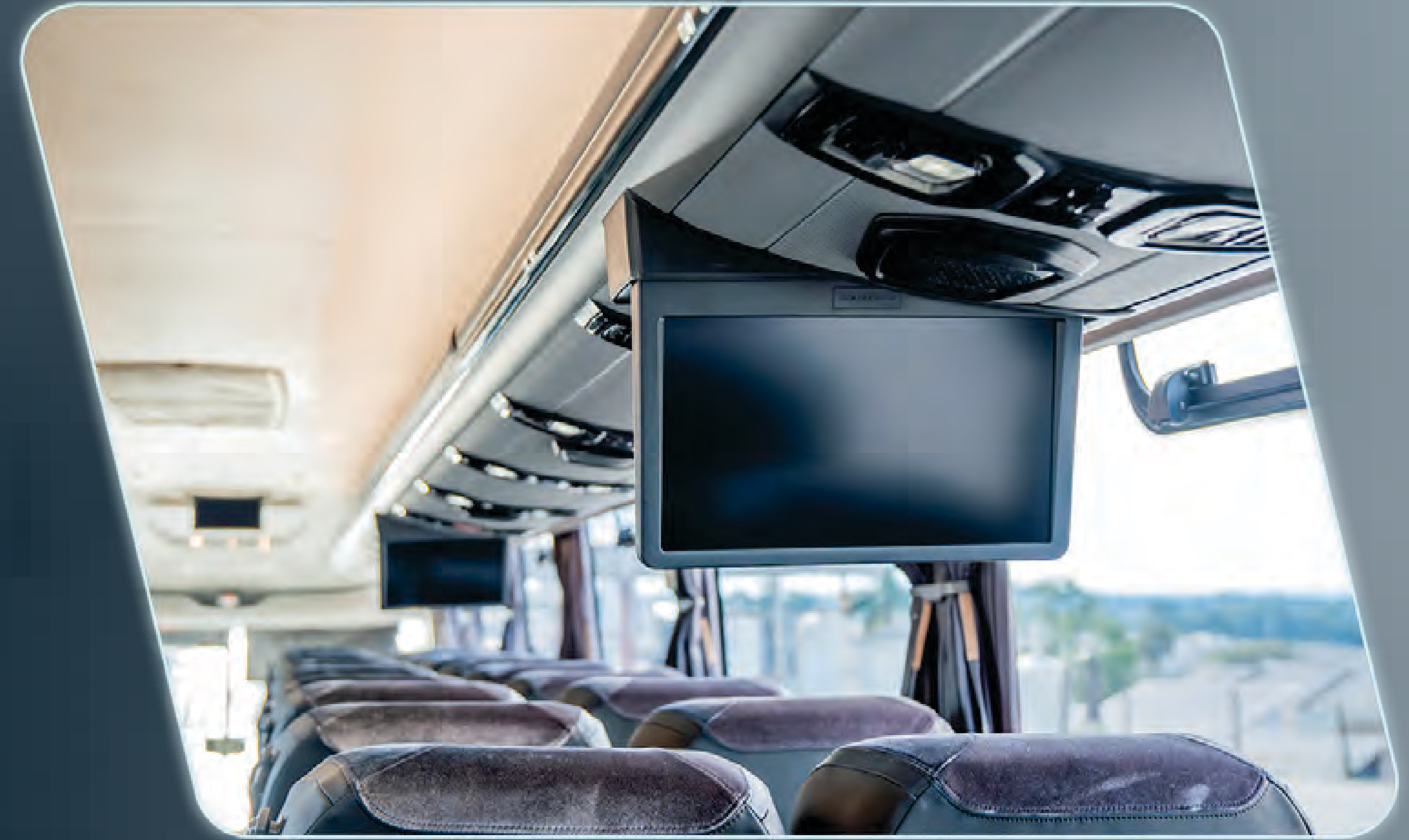
4 monitors DVD system and WIFI.