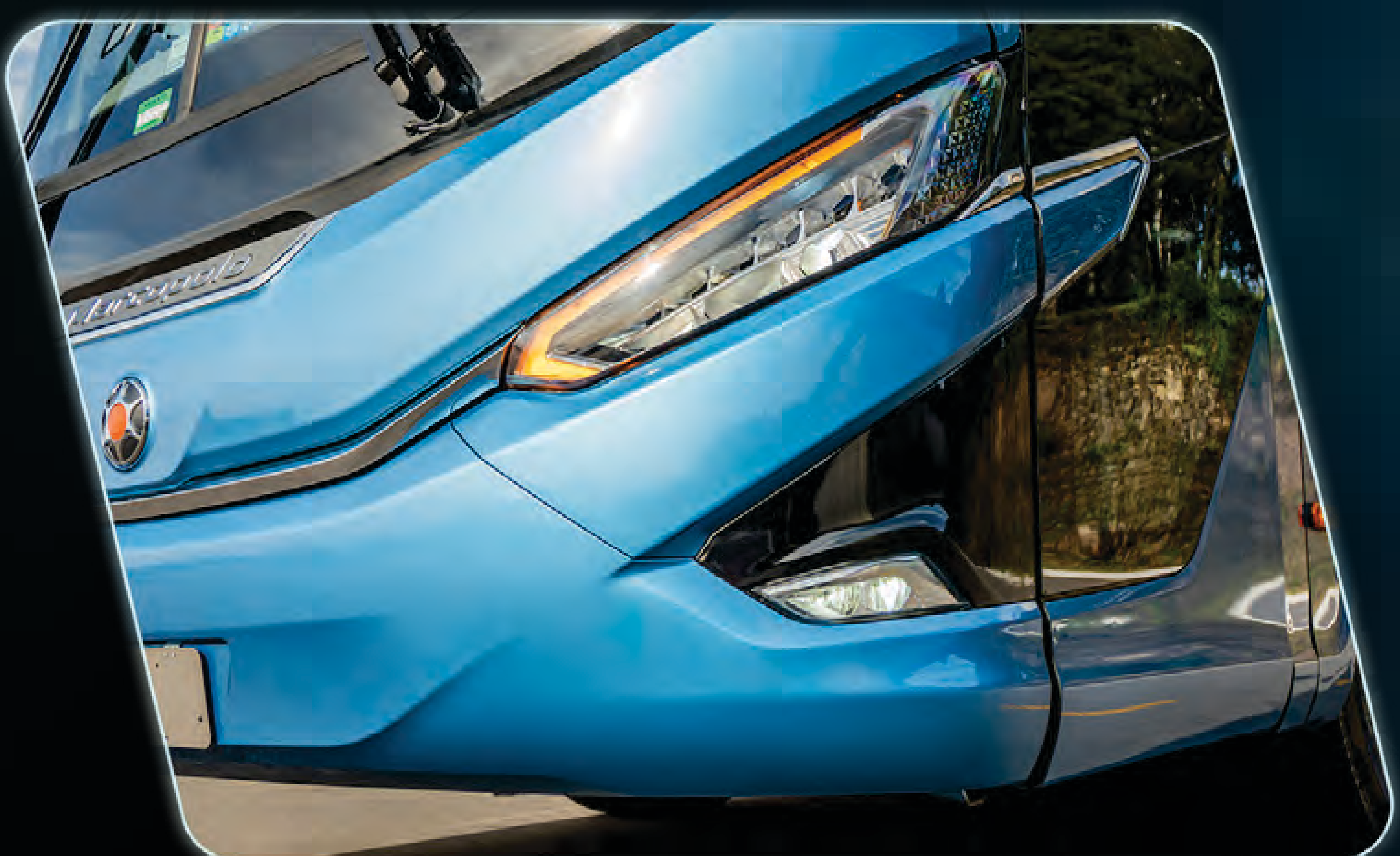
DCPD front and rear domes and bumpers.