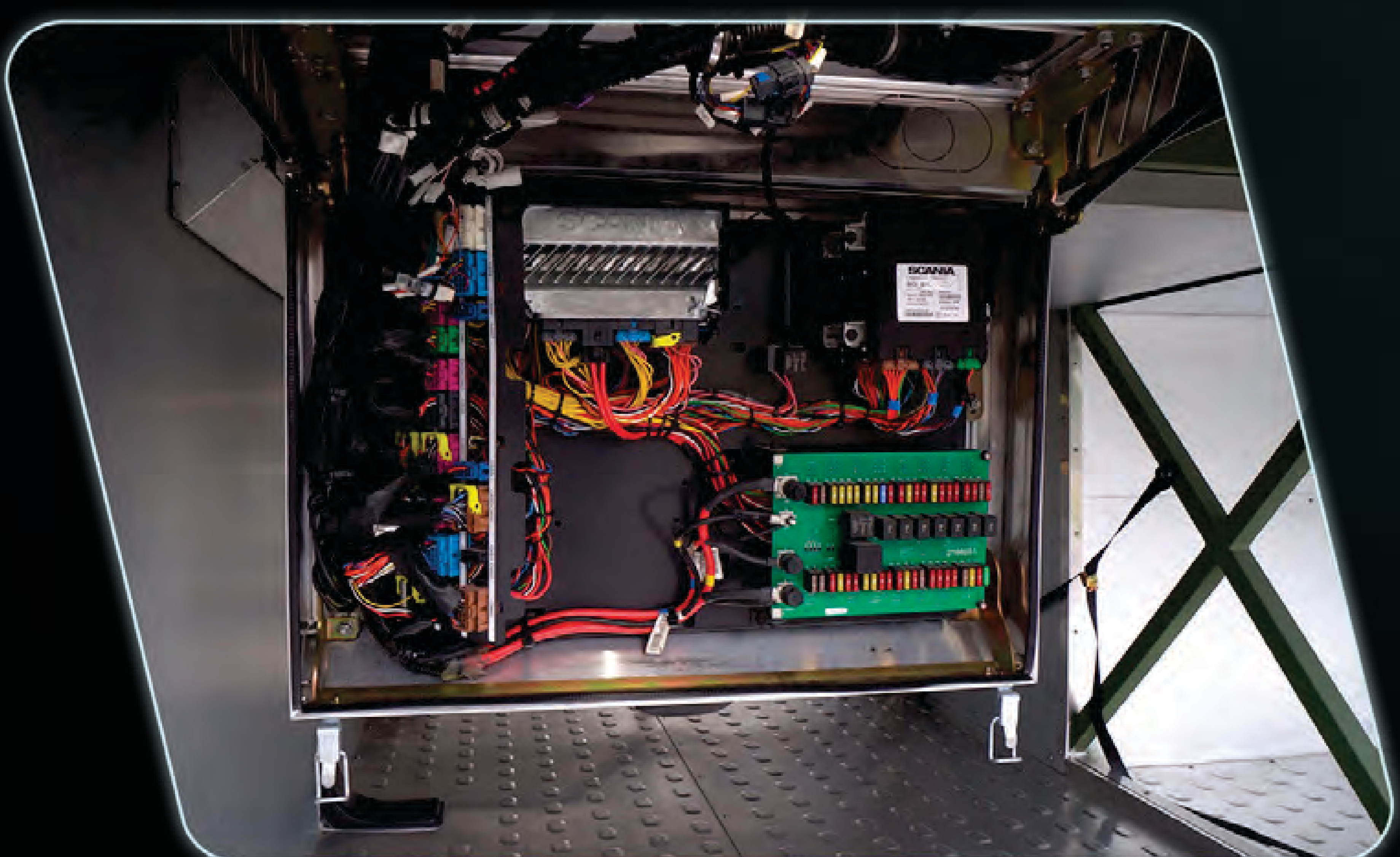
Optimized wiring harness routing, making maintenance and distribution of electronic components easier.