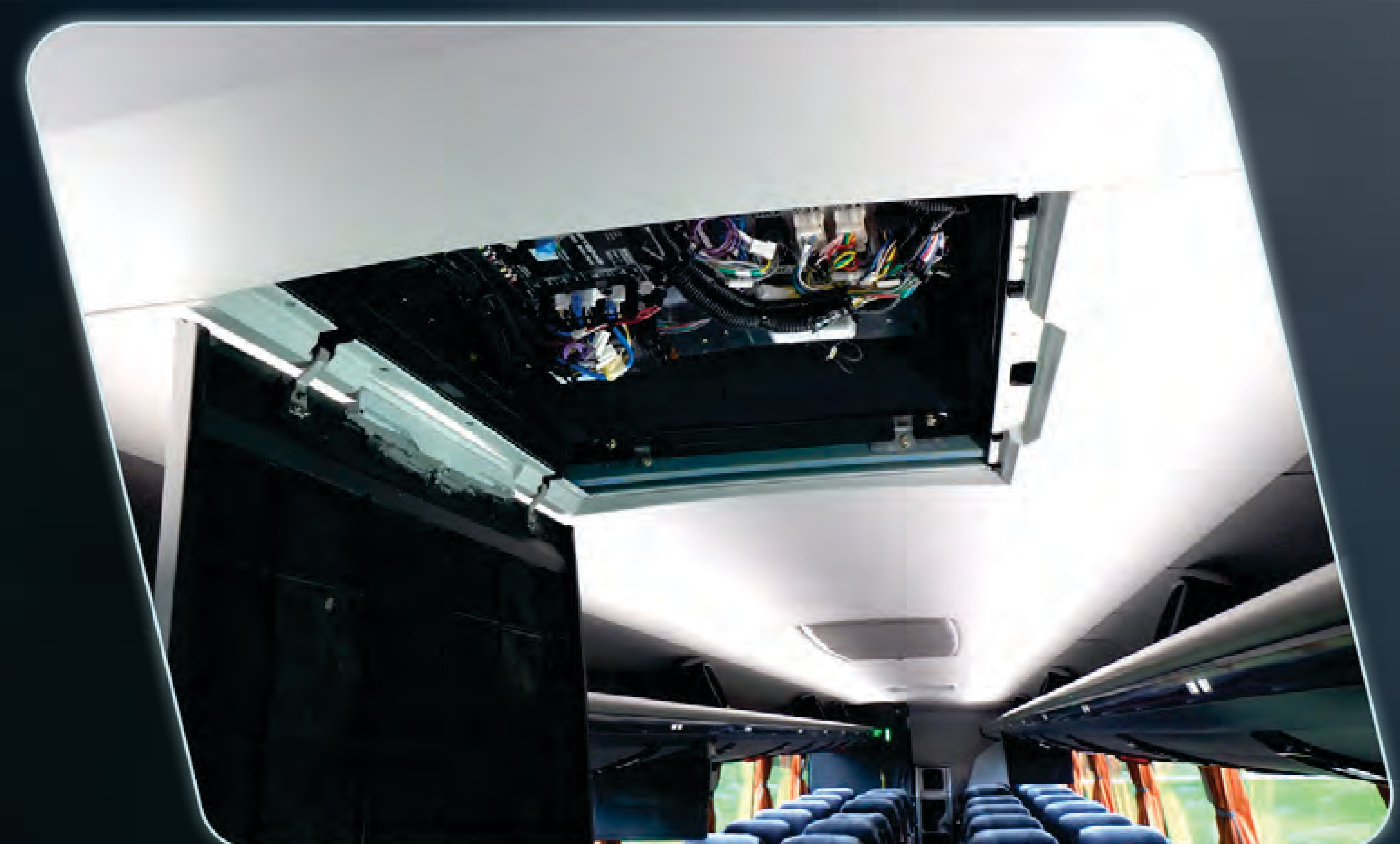
Standardized power stations making component identification easier.