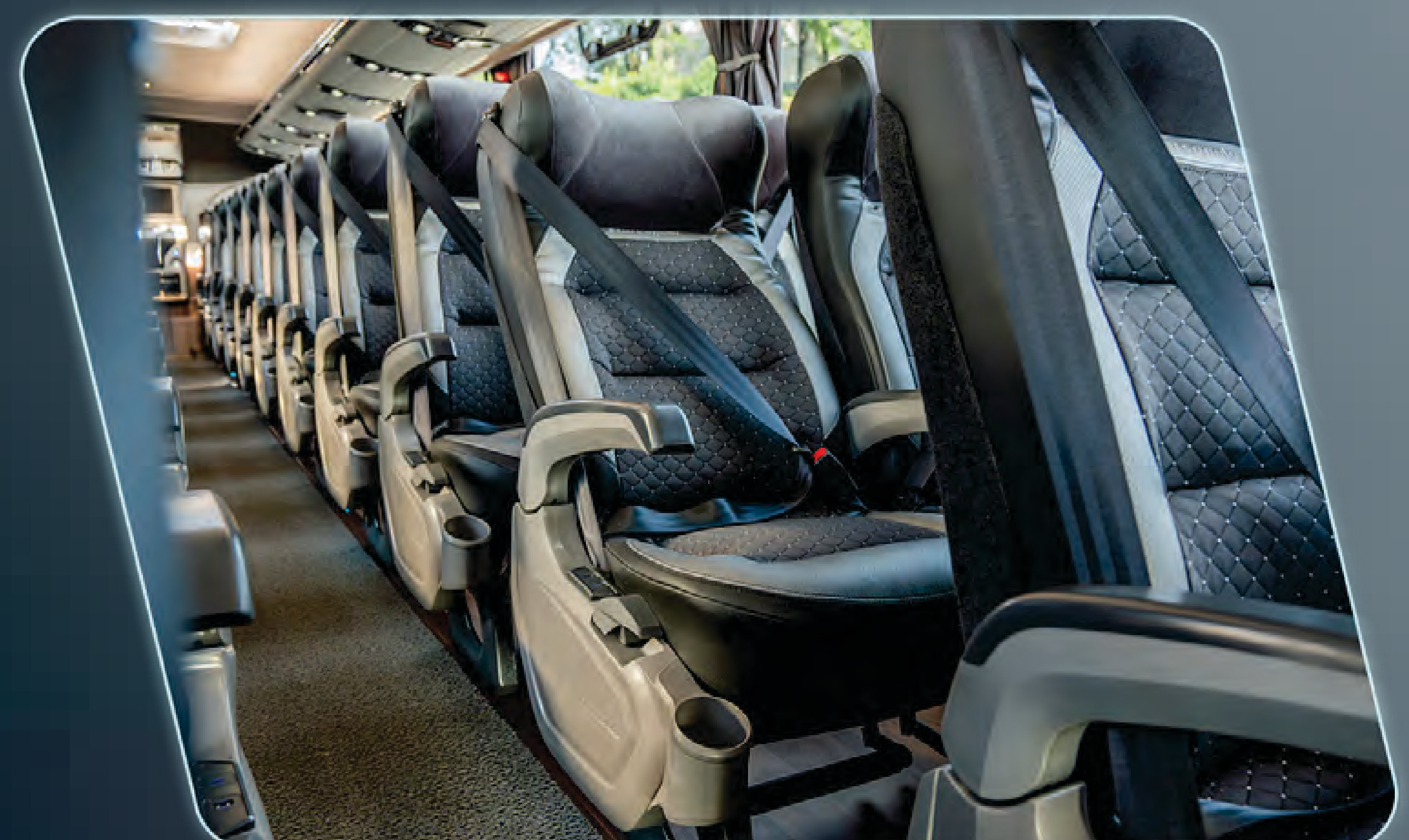
New G8 60 x Luxury Reclining Seats in 2x2 configuration with 3-point safety belt.