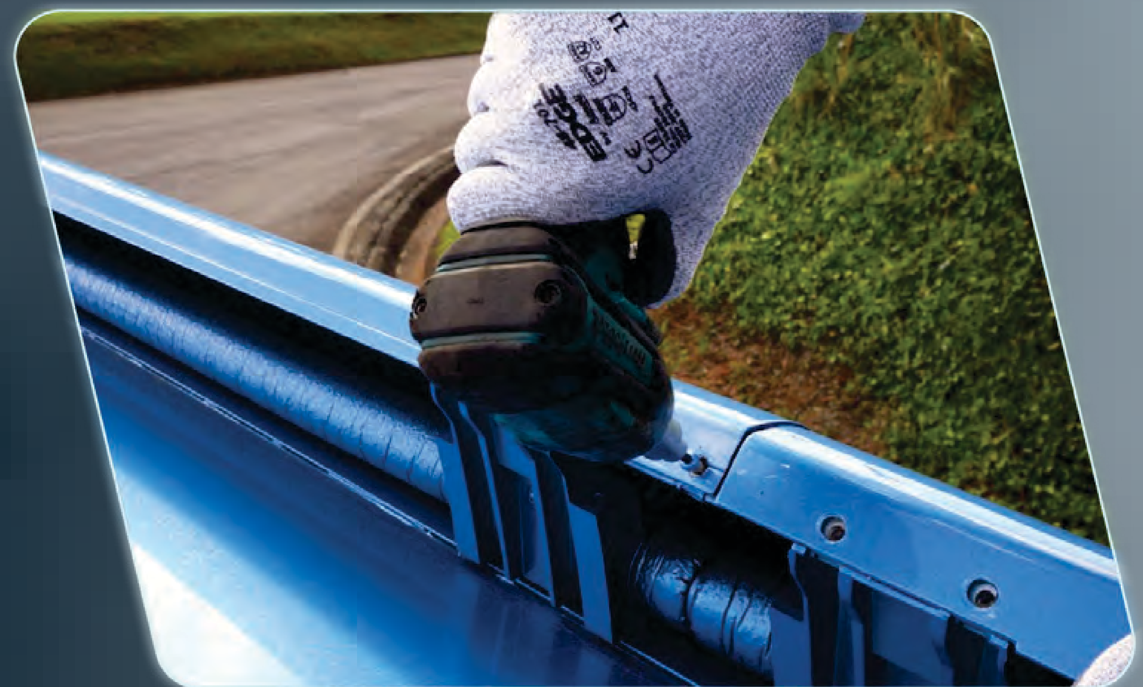
Air conditioning piping is routed on the outside of the vehicle, a system that facilitates maintenance.