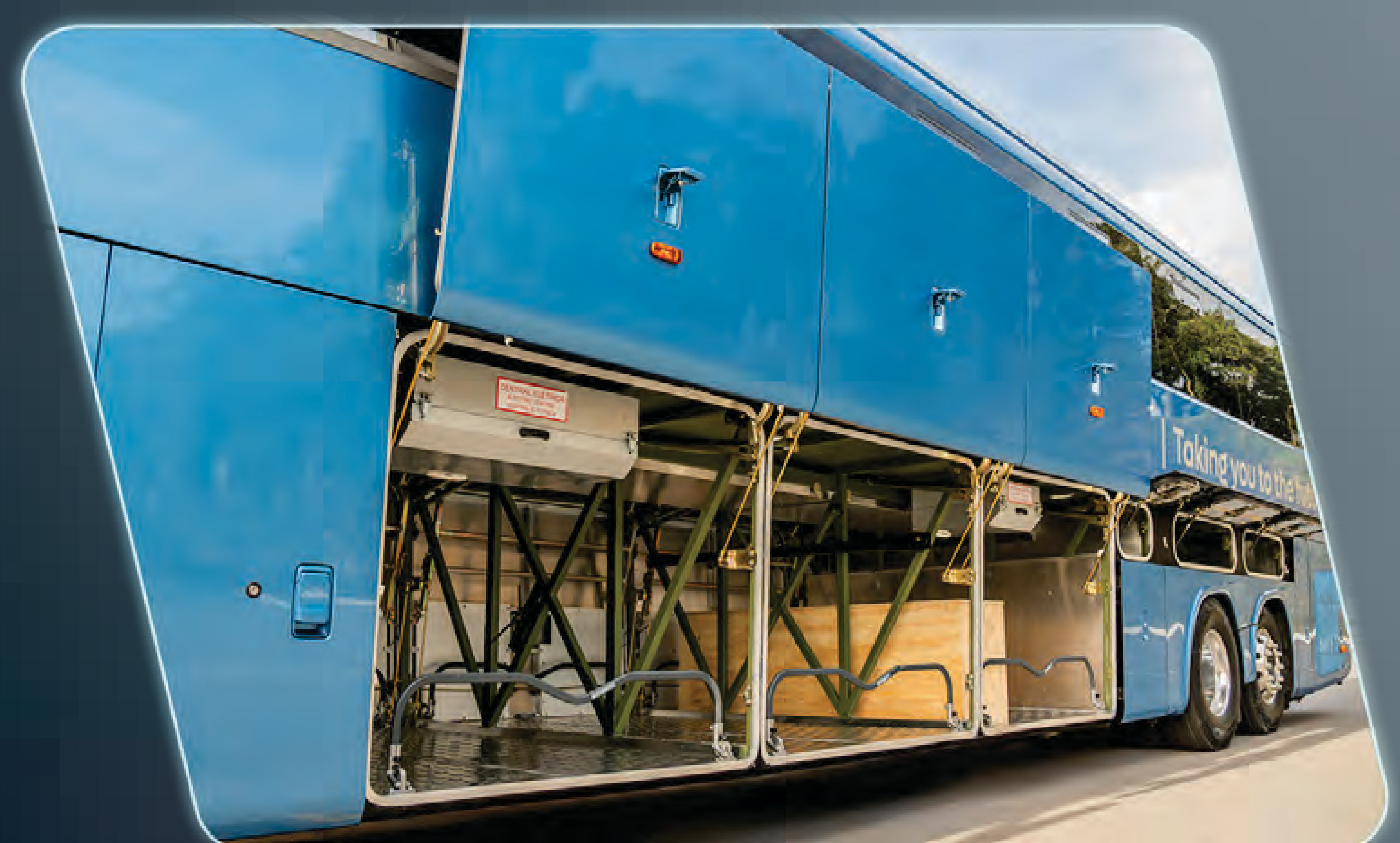
Ample luggage capacity, with compartments on the front and rear wheels.